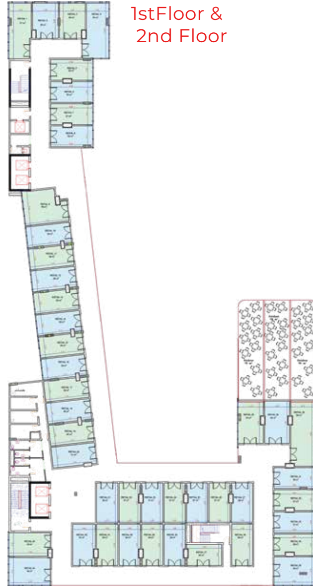
1st Floor & 2nd Floor