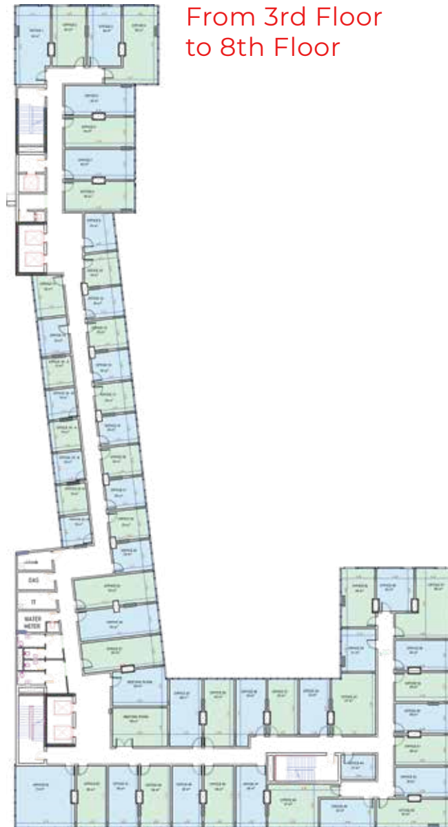
From 3rd Floor to 8th Floor