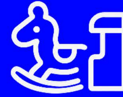
Kids area & arcade