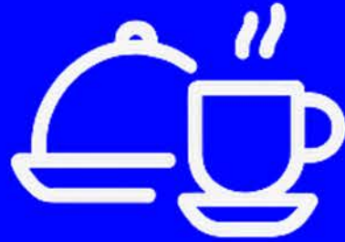
Restaurant & cafe